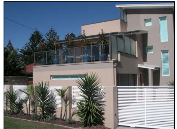
TrimGlass Balustrade & Privacy Screen With TrimSlat Fence & Sliding Gate

If you answer 'yes' to these questions please speak to your sales consultant for more information.