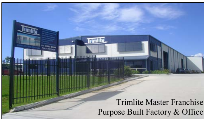
Trimlite Master Franchise Purpose Built Factory & Office

Not only that, but our exclusive management system, which has been developed specifically for Trimlite, will enable you to go home and enjoy yourself and your family without having to worry about all that annoying book-work.