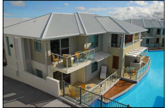
TrimGlass Pool Fence & Balustrade With TrimLouvre Sunhoods