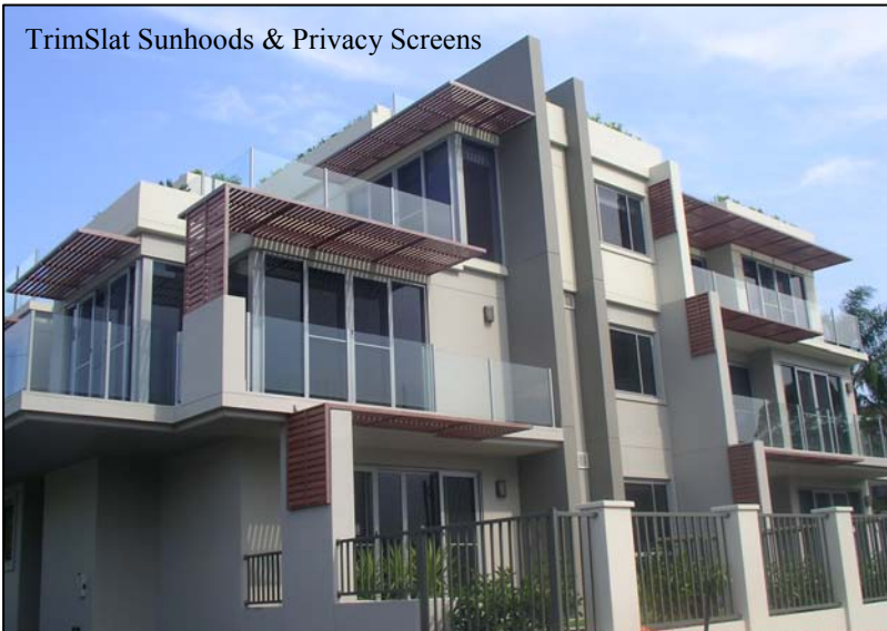
TrimSlat Sunhoods & Privacy Screens

"At Trimlite we respect, value and believe in our customers and ourselves.